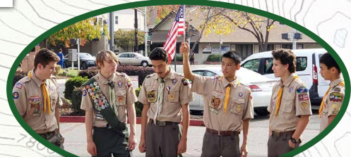
Color guard at community events