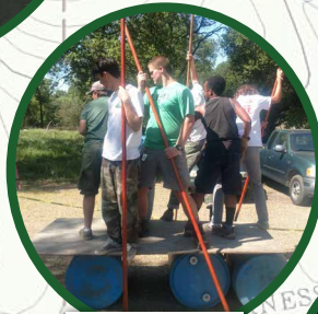
Competitions at Camporee