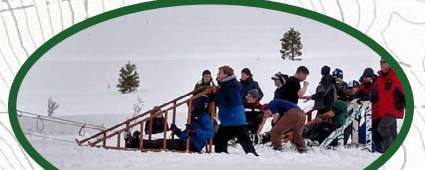
Snow camping & competitions at Klondike Derby