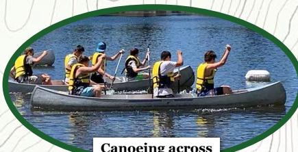
Canoeing across lakes and rivers