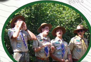
Scouts set up, organize, and staff Troop 1's annual summer camp, Camp Cody