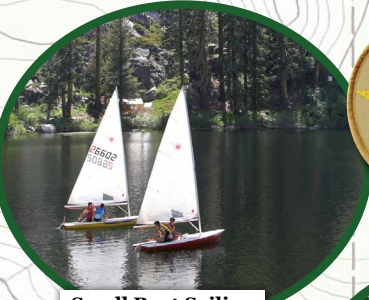
Small Boat Sailing Merit Badge at Camp Cody