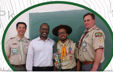
Over 100 experienced mentors and coaches will guide you along the Trail to Eagle Scout