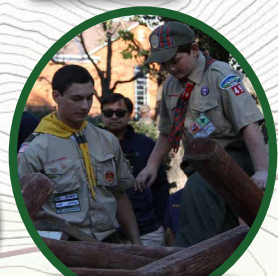
Crossing a bridge