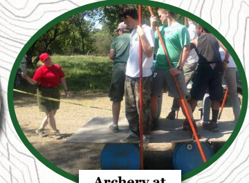
Archery at Camporee