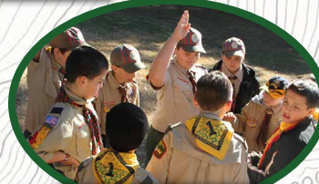
Welcome to Troop 1!