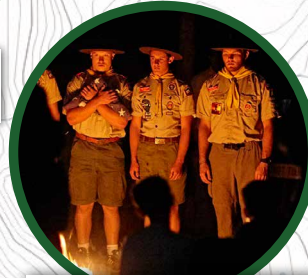
American flag honor guard